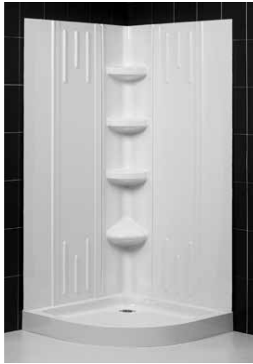
OPTIONAL SHOWER BASE & BACKWALLS