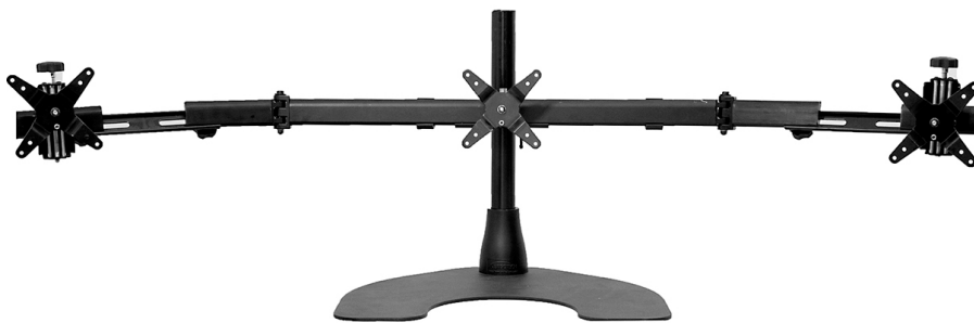
Desk Stand: 100-D16-B03-TW