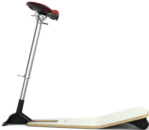
FLT-1000-WH-RD shown without anti-fatigue mat