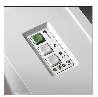
The electronic control panel allows for auto on/off, continuous run, and reverse operation.