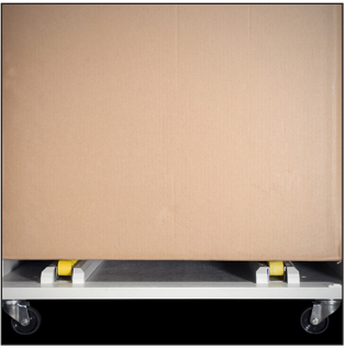
Conveyor of rollers on each side allows for easy removal of the 50 gallon waste container.