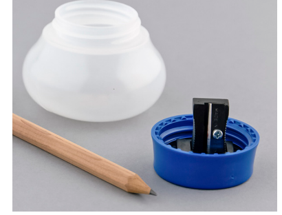
Wedge and canister sharpeners feature screw fastened blades for easy replacement.