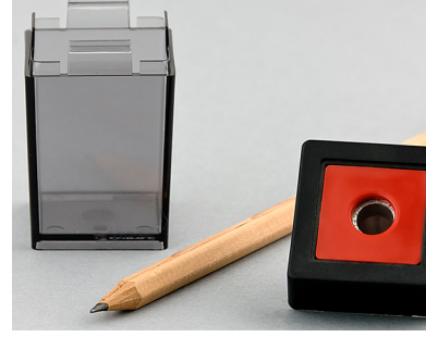
A high impact plastic shell protects if dropped, and keeps pencil shavings from spilling.