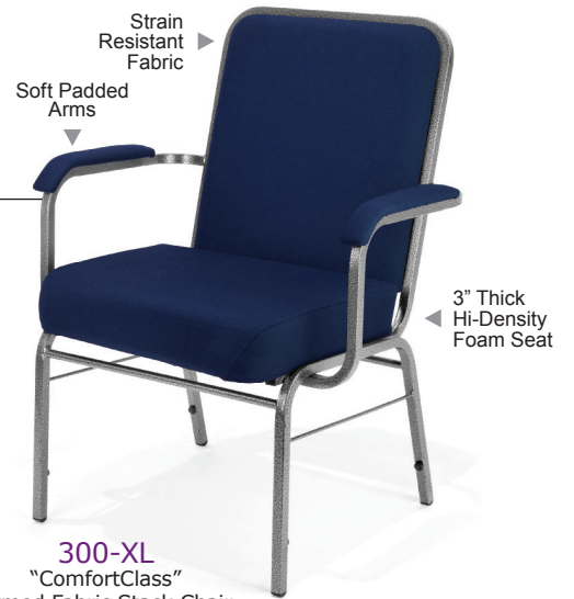
300-XL "ComfortClass" Armed Fabric Stack Chair