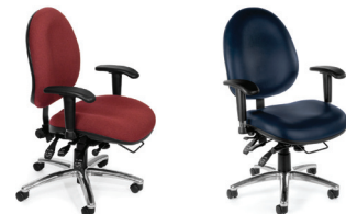
247 24 Hour Ergonomic Chair 247-VAM 24 Hour Ergonomic Chair