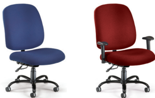
700 Armless Tak Chair 700-AA6 Armed Task Chair