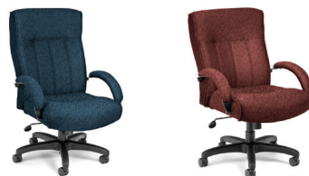
710 Hi-Back Executive Conference Chair 711 Mid-Back Executive Conference Chair