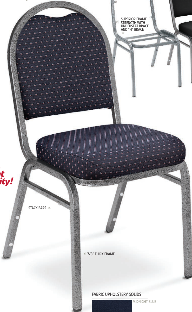
MODEL 9264-SV SHOWN

SUPERIOR FRAME STRENGTH WITH UNDERSEAT BRACE AND "H" BRACE