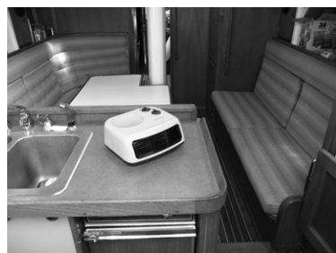
Small compact size