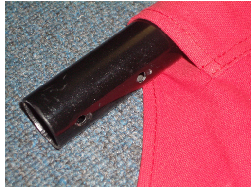
Step #3: Locate long bar with two holes is bottom left