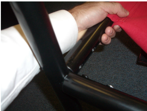
Step #4 Insert foot into long bar with two holes