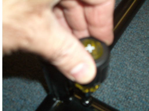
Step #7: Add screws to where appropriate and tighten.