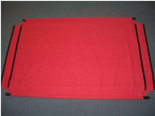
Step #2: Uncoil Fabric as Shown