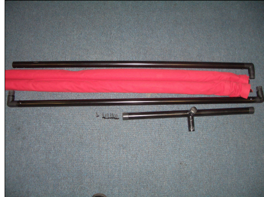
Step #1 Remove Items from box