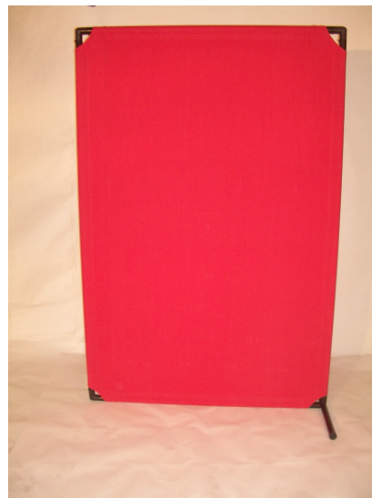
Step #9: Adjust joints as necessary to make sure partition is square.