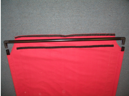
Step #6: Insert the short bar with two corner caps into the top of the long tubes.