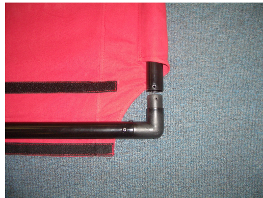
Step #5 Insert short bar with one corner bracket into the other long bar, this is bottom right.