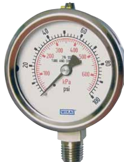
Bourdon Tube Pressure Gauge Model 232.53