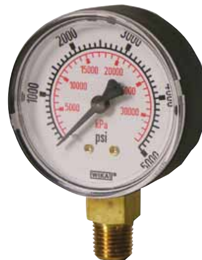
Bourdon Tube Pressure Gauge Type 111.10

Additional error when temperature changes from reference temperature of 68°F (20°C) ±0.4% for every 18°F (10°C) rising or falling. Percentage of span.