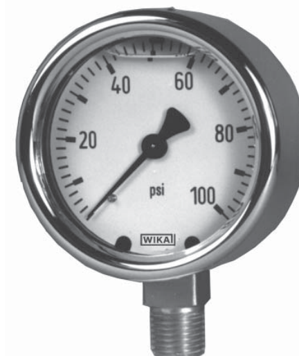
Bourdon Tube Pressure Gauge Model 213.40

Medium: max. +140°F (+60°C) - soldered system max. +212°F (+100°C) - brazed system